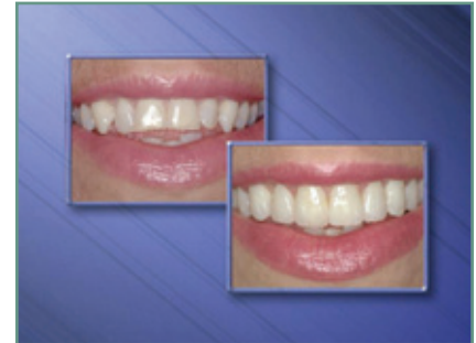
A dramatic improvement

A veneer is a thin shell of porcelain or plastic that is bonded to a tooth to improve its color and shape. A veneer generally covers only the front and top of a tooth. Veneers can be used to close spaces between teeth, lengthen small or misshapen teeth, or whiten stained or dark teeth. When teeth are chipped or beginning to wear, veneers can protect them from damage and restore their original appearance.