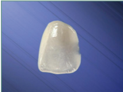
A translucent porcelain shell